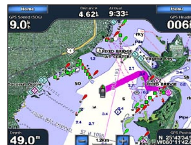
Guide To (BlueChart g2 Vision)