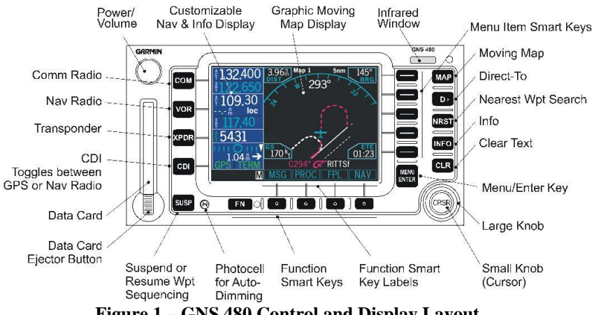
Figure 1 – GNS 480 Control and Display Layout

When you press the COM, VOR, or XPDR keys on the left side of the display, the display area for that function will be outlined and the information active for editing will be highlighted. The labels for the bottom row of smart keys will change for each function selected. Pressing the CDI key toggles between GPS and VOR/ILS/LOC. The operation of the smart keys across the bottom changes depending on the function selected.