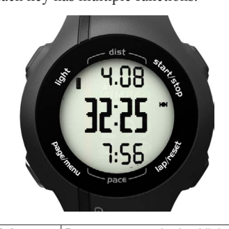
Keys Each key has multiple functions.