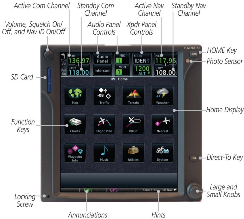
Figure 1 - GTN 750 Control and Display Layout

The GPS navigation functions and optional VHF communication and navigation radio functions are operated by dedicated hard keys, a dual concentric rotary knob, or the touchscreen.