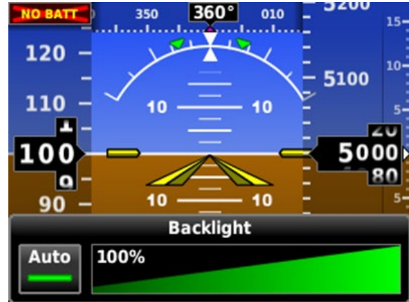
No Battery Detected