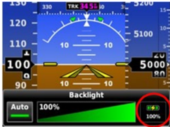
Valid Battery Indication