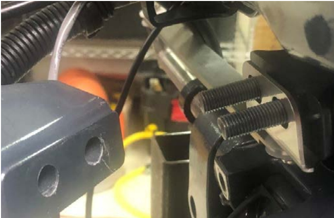
Installing the Motor Bracket Between the Motor and the Tiller Handle