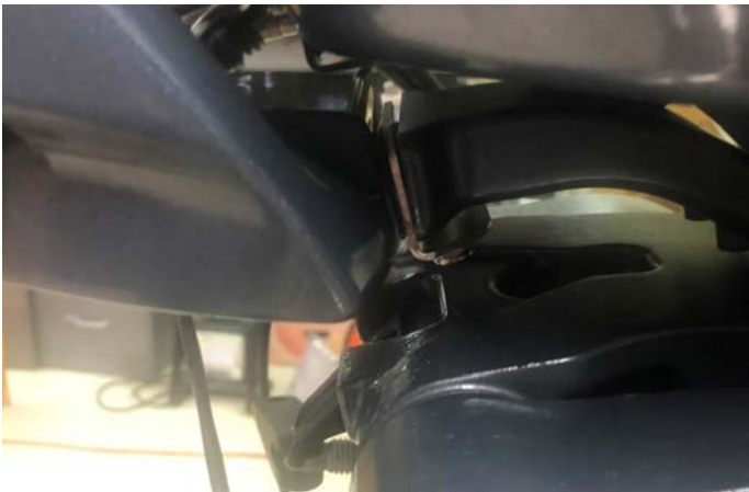
Motor Bracket Installed on the Motor