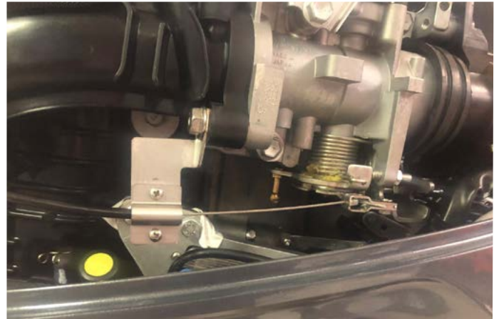
Complete Throttle Actuator Installation